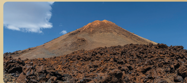
The peak of mount Teide

O This last part of the great Teide volcano is the "Pico", where the crater is located. In this area the so-called fumaroles are frequent: small columns of smoke that rise from ground. The strong smell of sulphur is common.