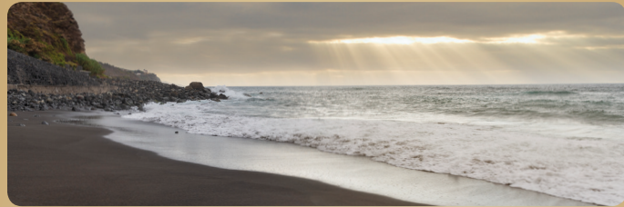
Partial view of Socorro beach