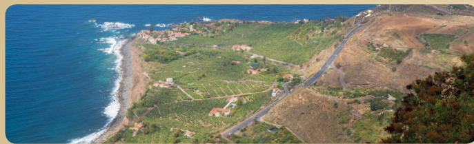
Views of La Rambla from El Riego

5 Here we turn right and begin the ascent to "camino de las Vueltas."