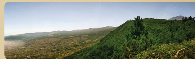
Views from the Asomadero lookout

I From the Asomadero lookout, located at 1,100 meters of altitude, you can enjoy spectacular views of Teide and the entire La Orotava Valley.