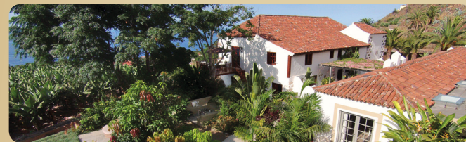
The "Cuatro Ventanas" hacienda

B The hacienda of the Viscount of Buen Paso had dwellings for the sharecroppers, gardens, seating areas and the main house with a U-shaped floor plan, inside which is a courtyard which was divided by a wall after the partition was made in 1863.