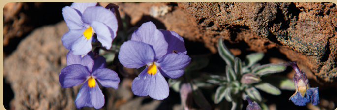
Teide Violets ( Viola cheiranthifolia )

In addition, the climatic conditions of the island allow this trail to be done during much of the year, except in winter when Teide is often covered with snow.