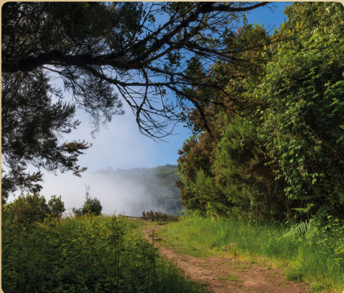
Path in the area of El Asomadero

7 We turn right onto the walkway along the side of the road in direction of the El Lance lookout.