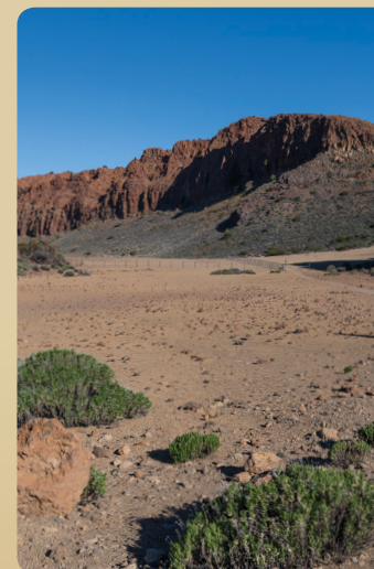
The "Guancheros" o "Las Brujas" plain

14 We continue along the trail from the previous junction. Once we cross the barrier we continue along the main trail that curves to the left and then we take the trail that continues to the right. We don't leave the trail until we reach the base of the "Fortaleza" cliff. Once we get there we do a short descent onto the plain.